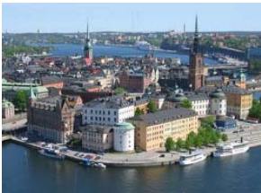
Royal Institute of Technology Stockholm, Sweden