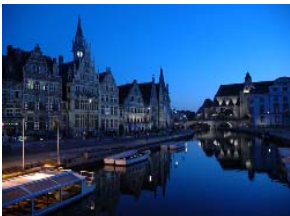
Ghent University Ghent, Belgium

The partners of the Erasmus Mundus MSc in Photonics: