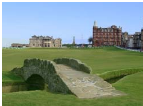
University of St Andrews Saint-Andrews, United Kingdom