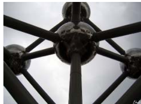
Vrije Universiteit Brussel Brussels, Belgium